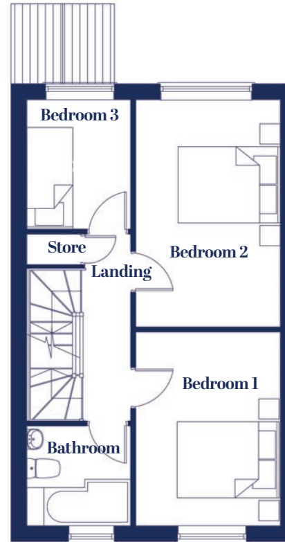
Bedroom 1 2.8m x 3.8m Bedroom 2 2.8m x 4.4m Bedroom 3 2m x 2.5m Bathroom 1.9m x 2m